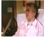
Verbal and emotional